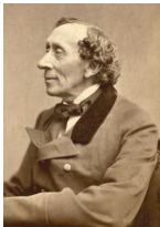
Hans Christian Anderson