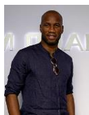
Didier Drogba (1978 – present)