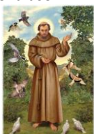
St Francis of Assisi