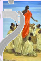
The Ascension Jesus Mafa