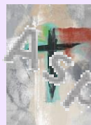
Expressionist Cross and Woods