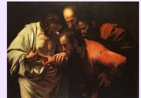
The Incredulity of St Thomas – Carravaggio