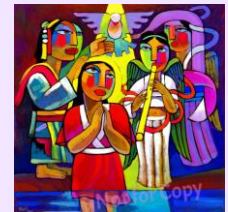
The Baptism of Jesus He Qi