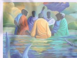
Baptism Ivey Hayes