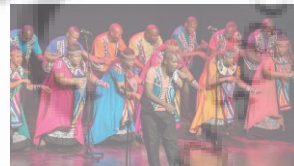
Soweto Gospel Choir