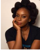
Chimamanda Ngozi Adichie