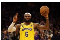
LeBron James (1984 – present)