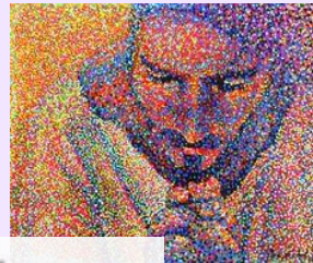
Prayer for redemption