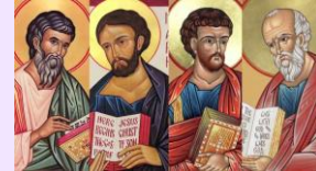
The Gospel writers – St Matthew, St Mark, St Luke and St John