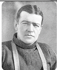
Sir Ernest Shackleton