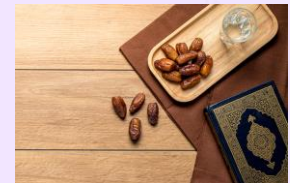
The Prophet and the dates