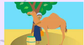
The crying camel