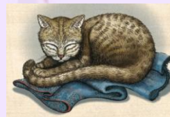
The Prophet and the cat