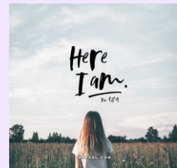
Isaiah 58 :9