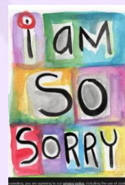
Sorry Linda Woods