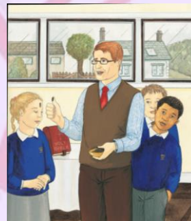
The giving of ashes