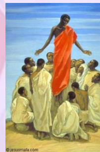
Ascension Jesus Mafa Project