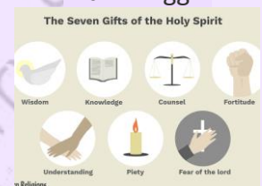
The Gifts of the Holy Spirit