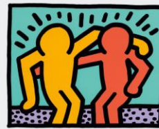
Best Buddies Keith Haring