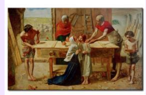
Christ in the house of his parents John Everett Millais