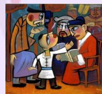
The boy Jesus in the Temple He Qi