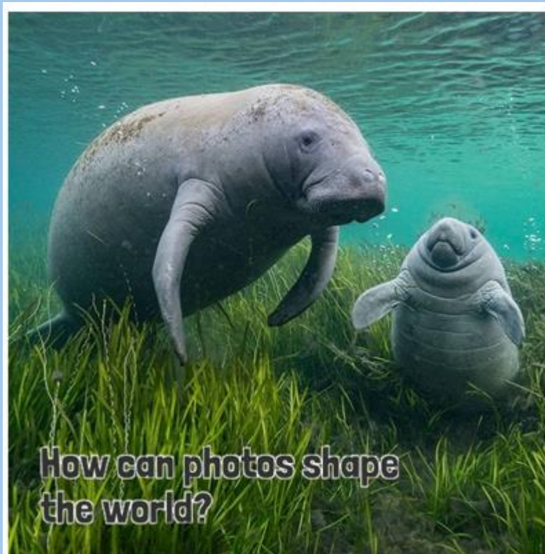
How can photos shape the world?

As part of our ongoing commitment to the British Values Curriculum and our unique Rainbow Curriculum here at St Anselm's, we invite you to read and this story with your children. Your involvement is crucial in reinforcing these values and qualities at home, so please take a moment to explore the themes and talk about them together. Let's work hand in hand to inspire thoughtful conversations and help our children be good friends, deep thinkers and morally responsible citizens with an active voice, who are informed to make positive contributions to society.