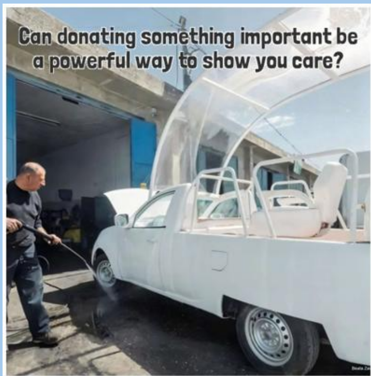
Can donating something important be a powerful way to show you care?

As part of our ongoing commitment to the British Values Curriculum and our unique Rainbow Curriculum here at St Anselm's, we invite you to read this story with your children. Your involvement is crucial in reinforcing these values and qualities at home, so please take a moment to explore the themes and talk about them together. Let's work hand in hand to inspire thoughtful conversations and help our children be good friends, deep thinkers and morally responsible citizens with an active voice, who are informed to make positive contributions to society.