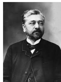
Gustave Eiffel (1832 – 1923) French civil engineer, best known for designing the world famous Eiffel Tower