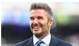
David Beckham (1975 - present)