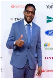
Javier Sotomayor Sanabria (1967 – present)