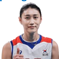
Kim Yeon-Koung (1988 – present )