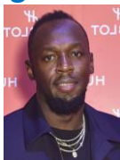
Usain Bolt (1986 – present)