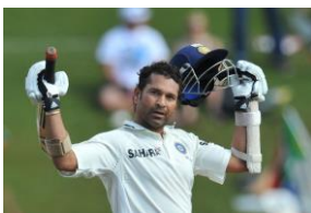
Sachin Tendulkar (1973 – present)