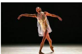
Misty Copeland (1982 – present)