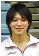
Kōhei Uchimura (1989 – present)