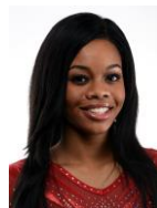
Gabrielle Douglas (1995 – present)