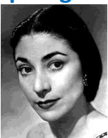
Margot Fonteyn DBE (1919 – 1991)