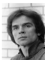
Rudolf Nureyev (1938- 1993)