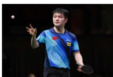
Fan Zhendong (1997 – present)