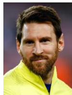
Lionel Messi (1987 – present)