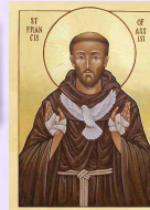
St Francis of Assisi