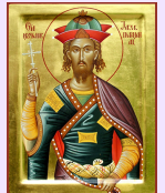
St James the Persian