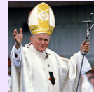
St Pope John Paul