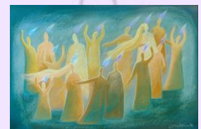
The day of Pentecost Ainevaserart