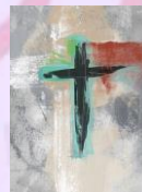
Expressionist Cross Linda Woods