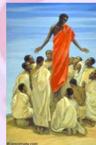
The Ascension Jesus Mafa