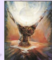
Le Calice Gemmail