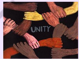
Unity in diversity