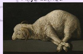
Agnus Dei Francisco De Zurbaran