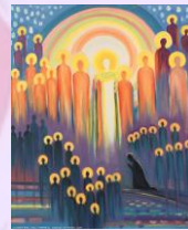
When we pray at Mass E Wang