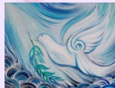
Dove of peace Anju Lamba