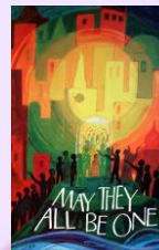
May they all be one