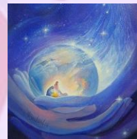
Advent: A time of waiting M Southward