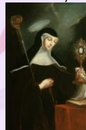
St Clare of Assisi