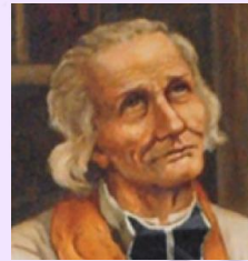
St John Mary Vianney