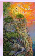
The Beatitudes Jen Norton