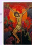
Jesus dies Turvey Abbey