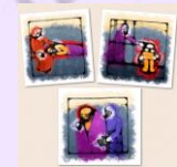
Matthew 25:31-36 Artist unknown