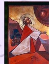
Jesus in the Garden of Gethsemane Artist unknown