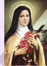
St Therese of Lisieux