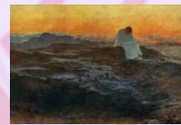
Christ in the Wilderness Briton Riviere