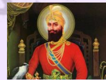
Guru Gobind Singh