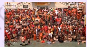
Kumbh Mela Festival