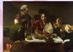
Supper at Emmaus Caravaggio