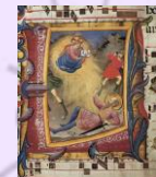
Icon of Saul's Conversion