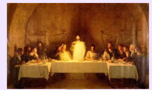
The Last Supper Bouveret