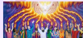
Coming of the Holy Spirit Concordia & Koinonia