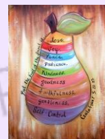
Fruits of the Spirit image