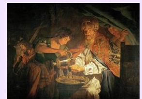
Pontius Pilate washing his hands Matthias Storm