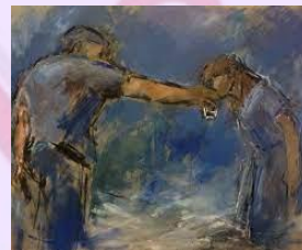
Give drink to the Thirsty Compassionate Art