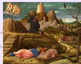
Agony in the garden Andrea Mantegna