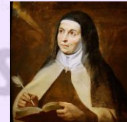
St Theresa of Avila