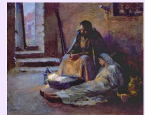
Nativity - Light in the Cellar Gary Melchers