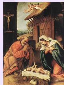
Nativity Lorenzo Lotto