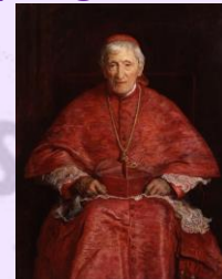
St John Henry Newman