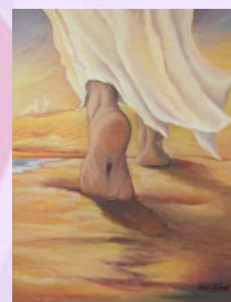
Follow me Beau Ettestad