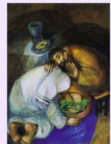
Washing of Feet Sieger Koder