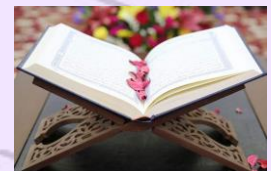
The Qur'an on the Rehal