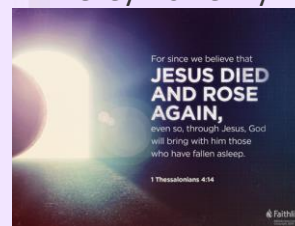
1 Thessalonians 4