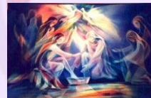
Jesus Washing the Disciples' Feet Leszek Forczek