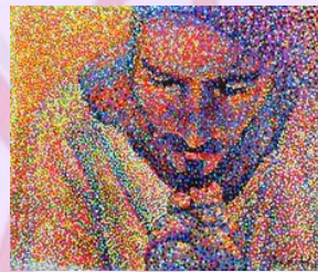
Prayer for redemption