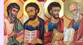
The Gospel writers – St Matthew, St Mark, St Luke and St John