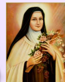
St Therese of Lisieux