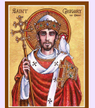
St Gregory the Great