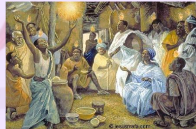
Pentecost - Jesus Mafa