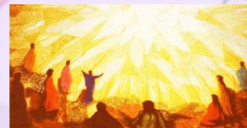
Holy Spirit as Helper Council for World Mission