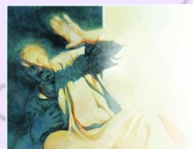
Blinded on the way Irmo Rector